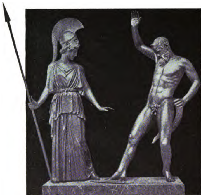
Fig. 55. Athena and Marsyas.

his empty skin hung on a tree as a warning to all. Some say that Midas was present at this contest and that in punishment for his foolish judgment in favor of the Silenus he was given